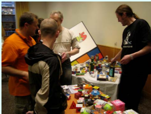
Rich's Puzzle Collection