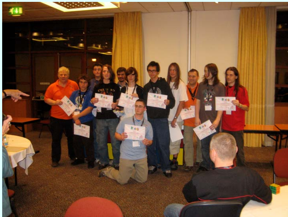
Rubik's Cube finalists