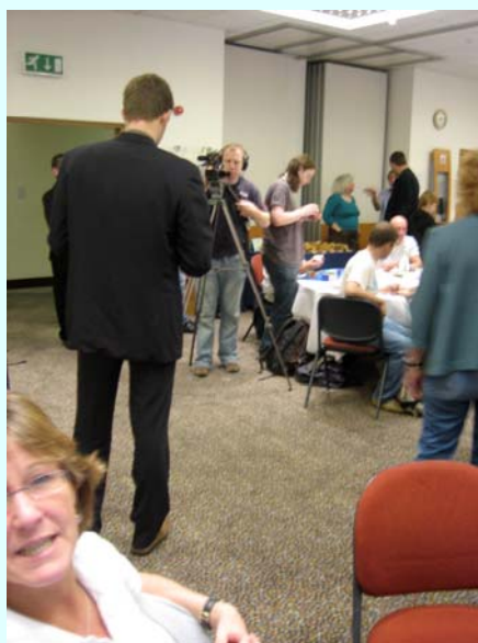
Live on TV